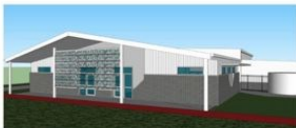
S.T.E.M. 3D IMAGES