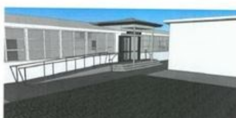
ADMINISTRATION 3D IMAGES